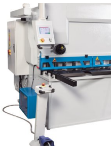
CybTouch 8 G is a powerful control that perfectly complements premium plate shears