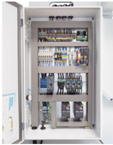
Premium components for guaranteed-lasting reliable operation