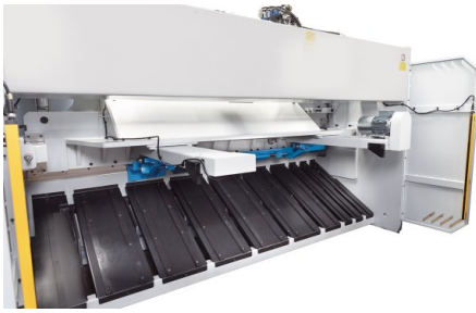
With the optional pneumatically controlled plate hold-up fixture even thin metal sheets can be positioned with high accuracy at the back gauge