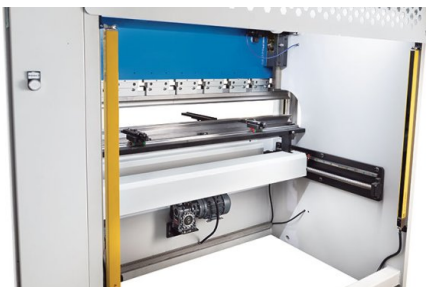
The rear side is protected by light curtains