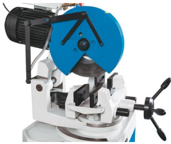
KKS 315 T